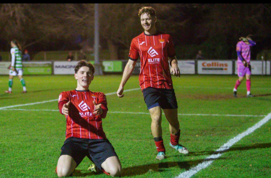
14 Dec LEAGUE v Waltham Abbey WON 2-0