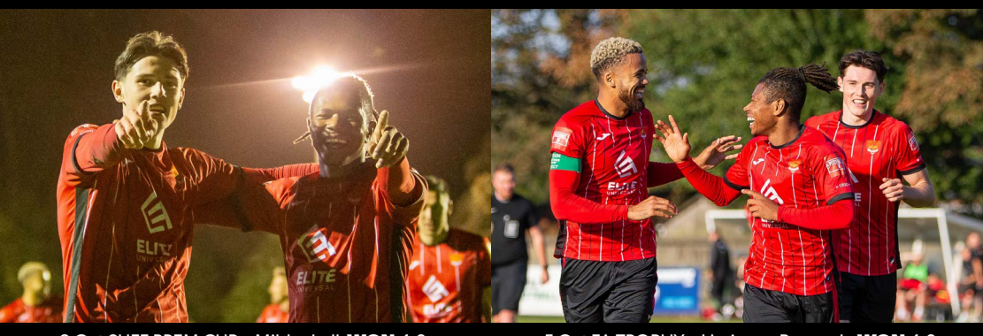
2 Oct SUFF PREM CUP v Mildenhall WON 4-0