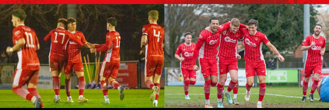
1 Jan LEAGUE v Stowmarket WON 2-1

2024 saw the Seasiders go unbeaten at home in all competitive competitions over 90 minutes - winning 25 games and drawing 4 scoring 77 goals in the process