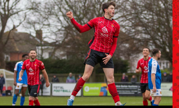
26 Dec LEAGUE v Ipswich Wanderers WON 1-0