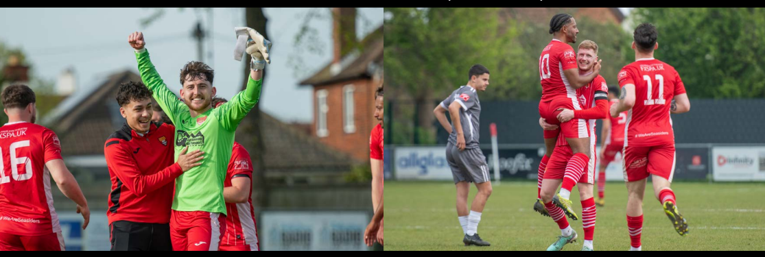
13 April LEAGUE v Witham Town WON 1-0