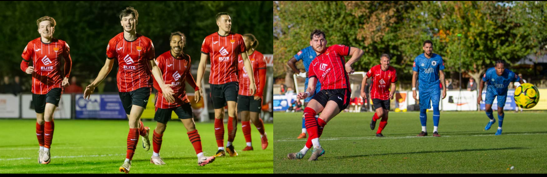
5 Oct FA TROPHY v Haringey Borough WON 4-0