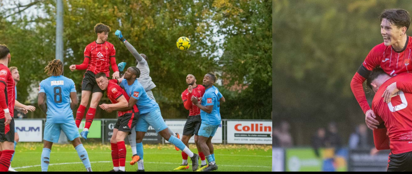
2 Nov LEAGUE v Brentwood Town WON 2-1