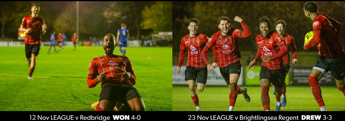
12 Nov LEAGUE v Redbridge WON 4-0