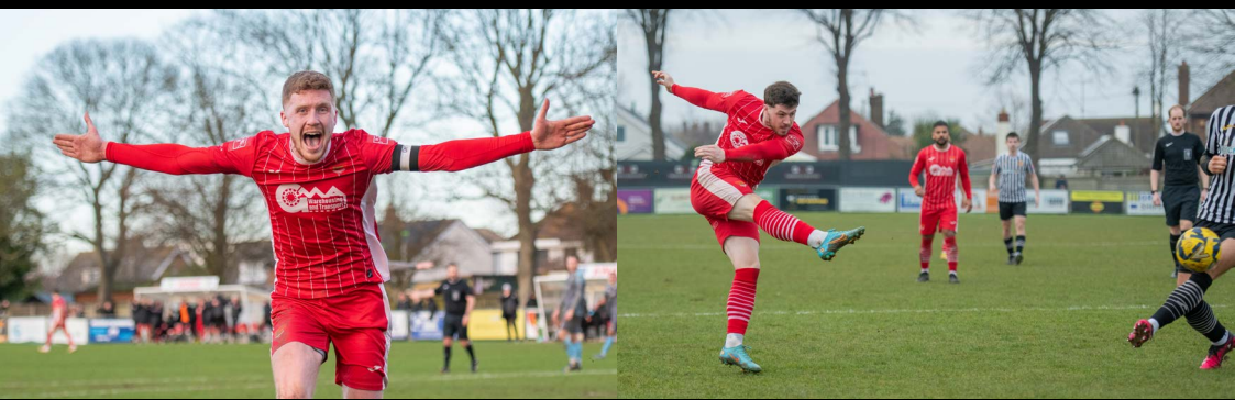
10 Feb LEAGUE v Walthamstow WON 2-0