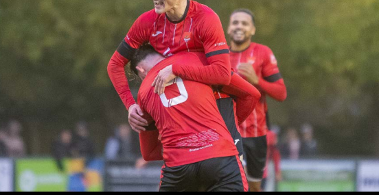
9 Nov LEAGUE v Cambridge City WON 2-0