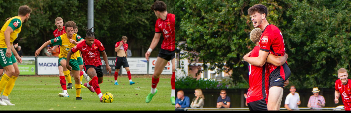
31 Aug FA CUP v Leverstock Green WON 5-1