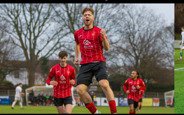
30 Nov LEAGUE v Mildenhall Town WON 3-0