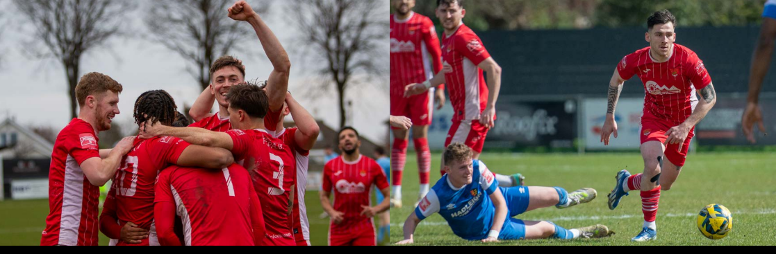
16 March LEAGUE v Brentwood Town WON 1-0