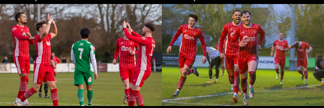
27 Jan LEAGUE v Basildon United WON 1-0