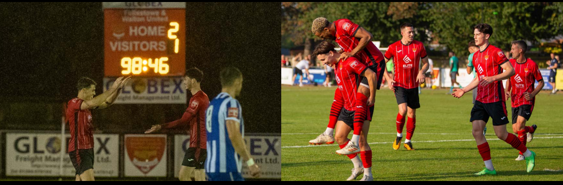
10 Sept LEAGUE v Wroxham WON 2-1