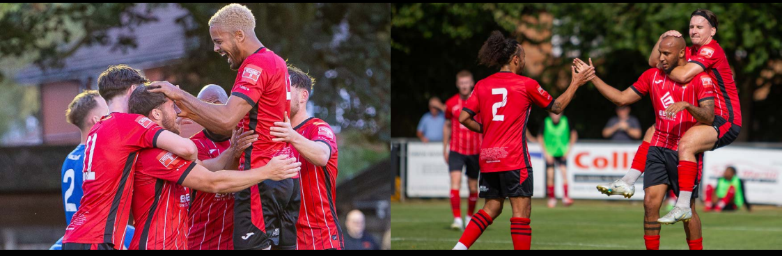
20 Aug LEAGUE v Bury Town WON 4-0