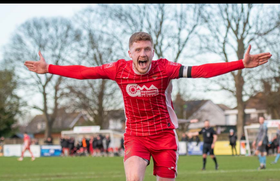
24 Feb LEAGUE v Grays Athletic WON 3-2