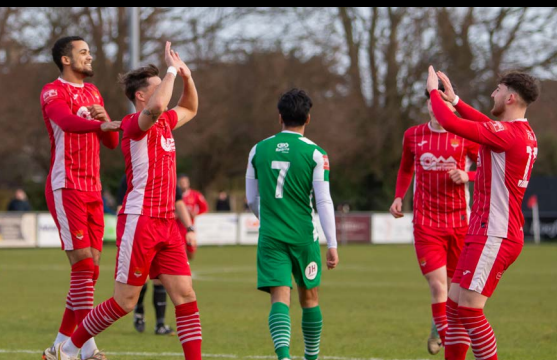
27 Jan LEAGUE v Basildon United WON 1-0