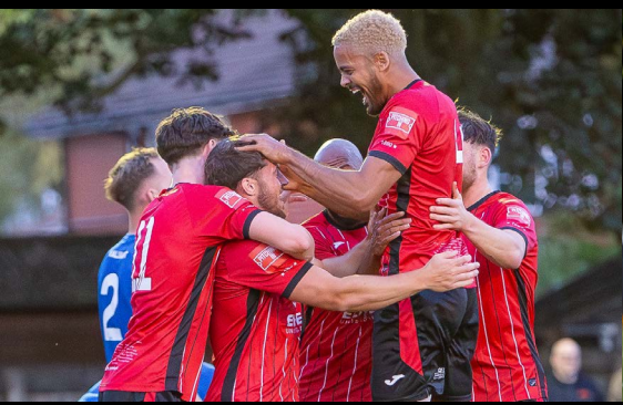
20 Aug LEAGUE v Bury Town WON 4-0