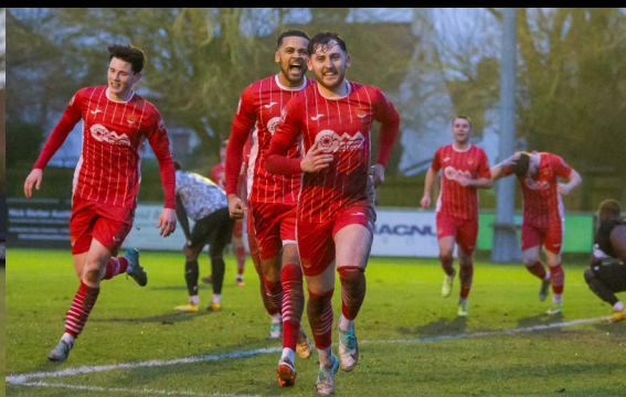
10 Feb LEAGUE v Walthamstow WON 2-0