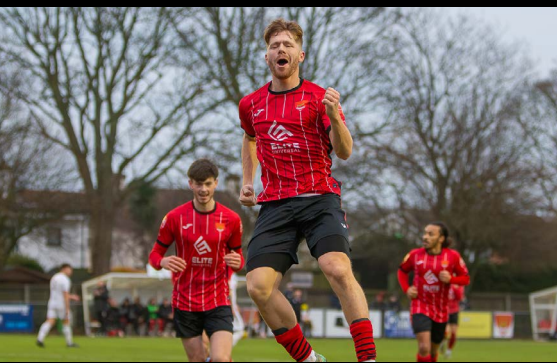
30 Nov LEAGUE v Mildenhall Town WON 3-0