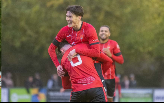
9 Nov LEAGUE v Cambridge City WON 2-0