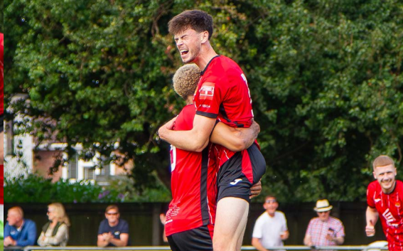
7 Sept FA Trophy v Basildon United WON 4-2