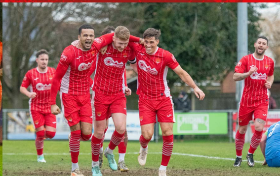
13 Jan LEAGUE v Lowestoft Town WON 3-0