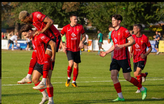
21 Sept FA TROPHY v Enfield WON 2-1