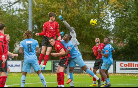
2 Nov LEAGUE v Brentwood Town WON 2-1