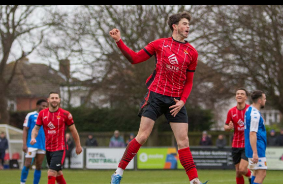
26 Dec LEAGUE v Ipswich Wanderers WON 1-0