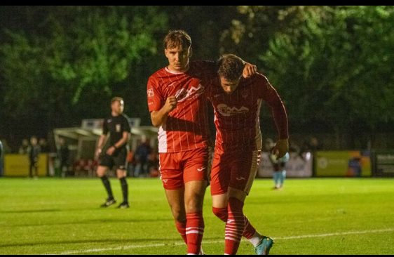
30 April LEAGUE v Bowers & Pitsea DREW 2-2