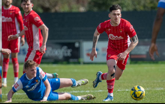
1 April LEAGUE v Ipswich Wanderers DREW 1-1