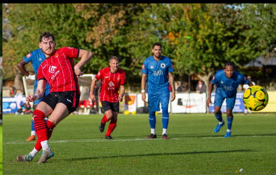
19 Oct LEAGUE v Walthamstow WON 2-1