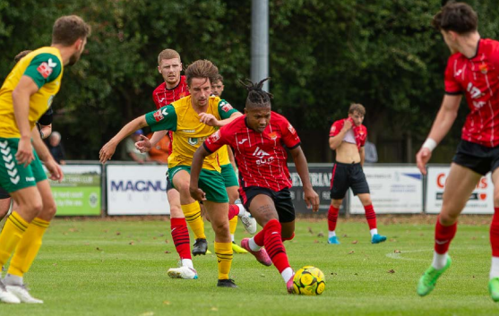
31 Aug FA CUP v Leverstock Green WON 5-1