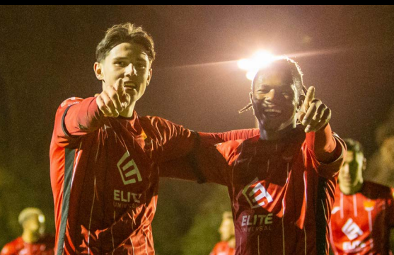
2 Oct SUFF PREM CUP v Mildenhall WON 4-0