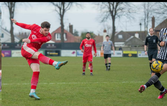
9 March LEAGUE v Heybridge Swifts DREW 0-0