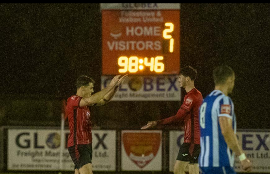
10 Sept LEAGUE v Wroxham WON 2-1