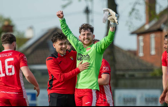
13 April LEAGUE v Witham Town WON 1-0