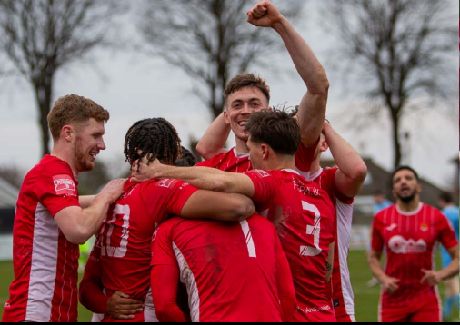
16 March LEAGUE v Brentwood Town WON 1-0