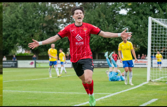
10 Aug LEAGUE v Newmarket Town WON 6-1