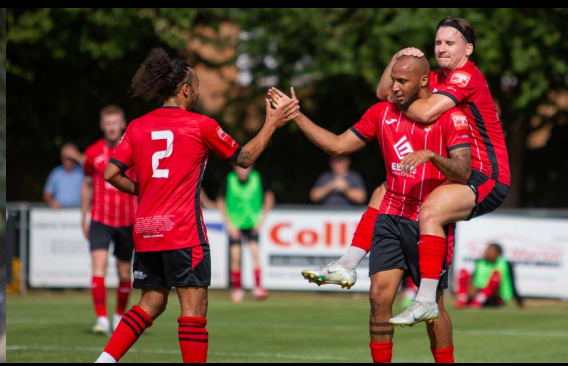
26 Aug LEAGUE v Bury Town WON 3-1