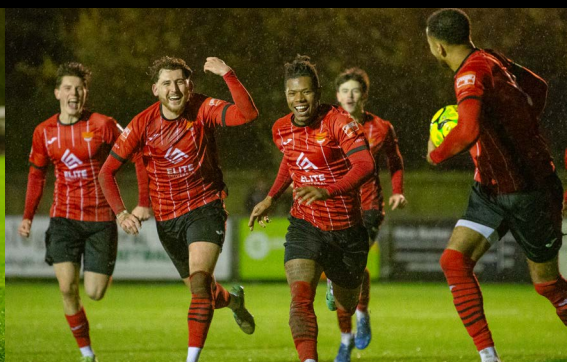
23 Nov LEAGUE v Brightonsea Regent DREW 3-3