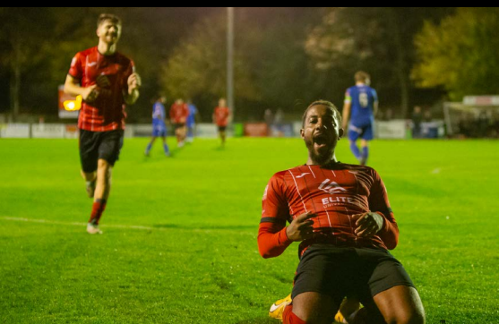
12 Nov LEAGUE v Redbridge WON 4-0