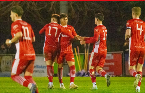
1 Jan LEAGUE v Stowmarket WON 2-1

2024 saw the Seaside go unbeaten at home in all competitive competitions over 90 minutes - winning 25 games and drawing 4 scoring 77 goals in the process