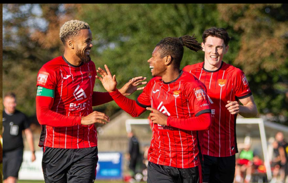
5 Oct FA TROPHY v Haringey Borough WON 4-0