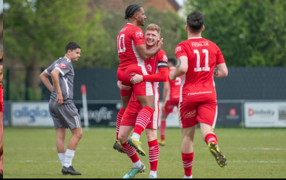
27 April LEAGUE v New Salamis WON 6-1