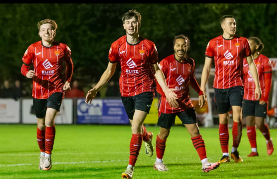
8 Oct LEAGUE v Basildon United WON 2-1