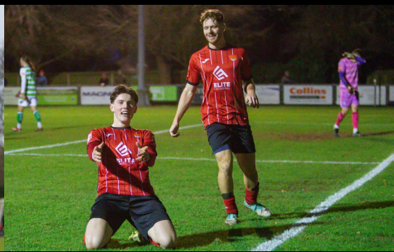
14 Dec LEAGUE v Waltham Abbey WON 2-0