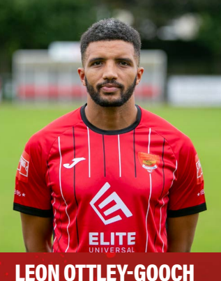
DEFENDER Sponsor: Garratt & Pearson Plumbing & Heating Ltd